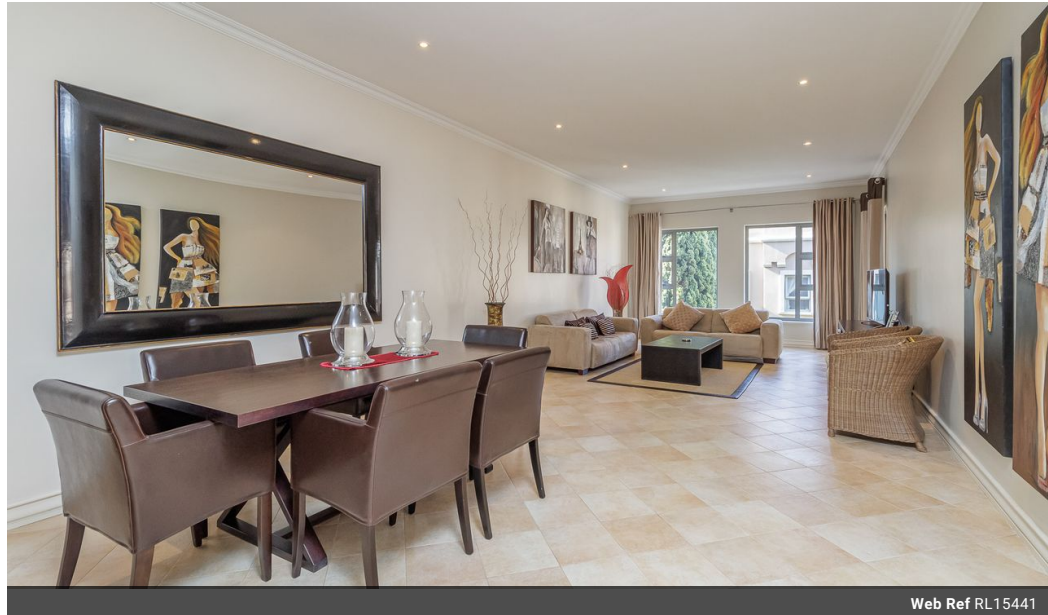
Web Ref RL15441

Loft Office 6 The Woodmill Lifestyle Centre Vredenburg Road Devonvallei Stellenbosch 7600